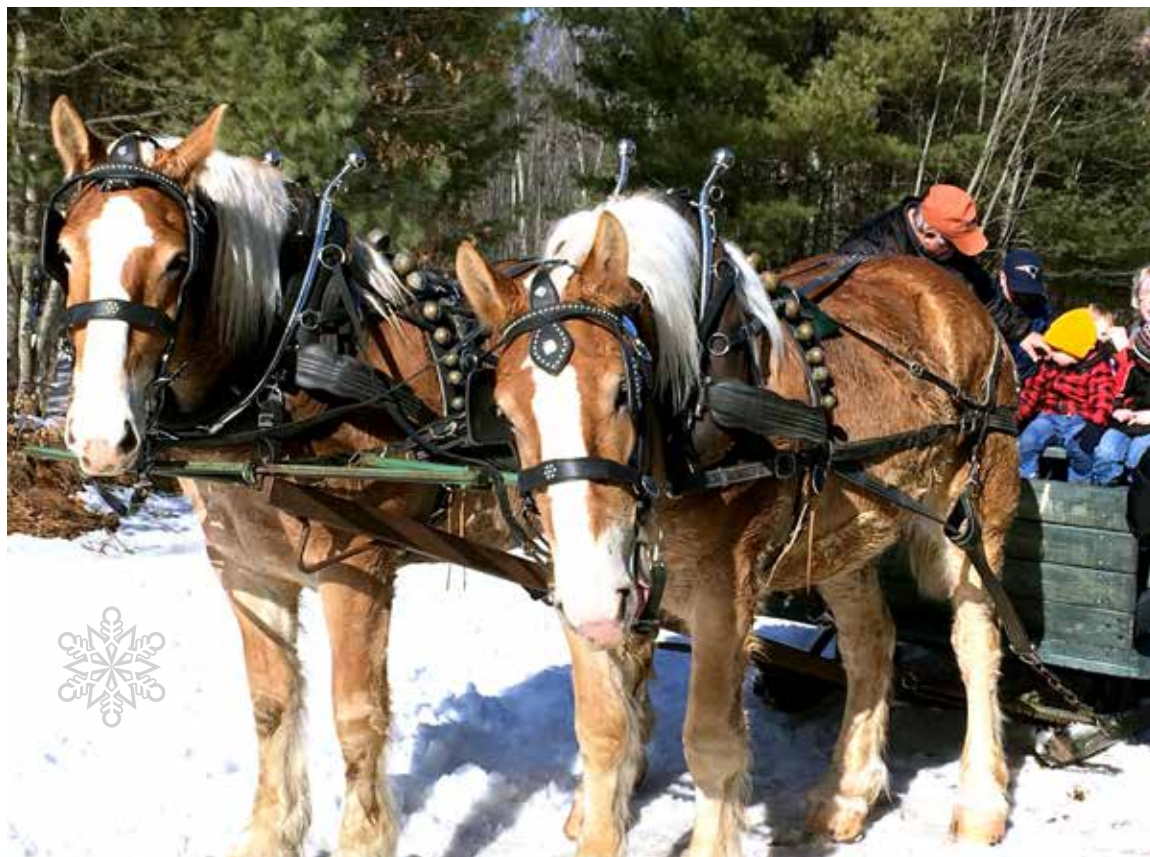
These draft horses were working hard pulling visitors on the sleigh during Winterfest at Abenaki Draft Horse Club in Lyman on Feb. 23.