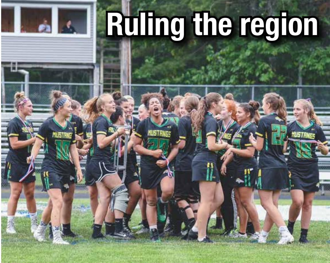
The Massabesic Varsity Girls Lacrosse team celebrates after winning their third consecutive Class A South Regional Championship on June 13. See page 8 for story.