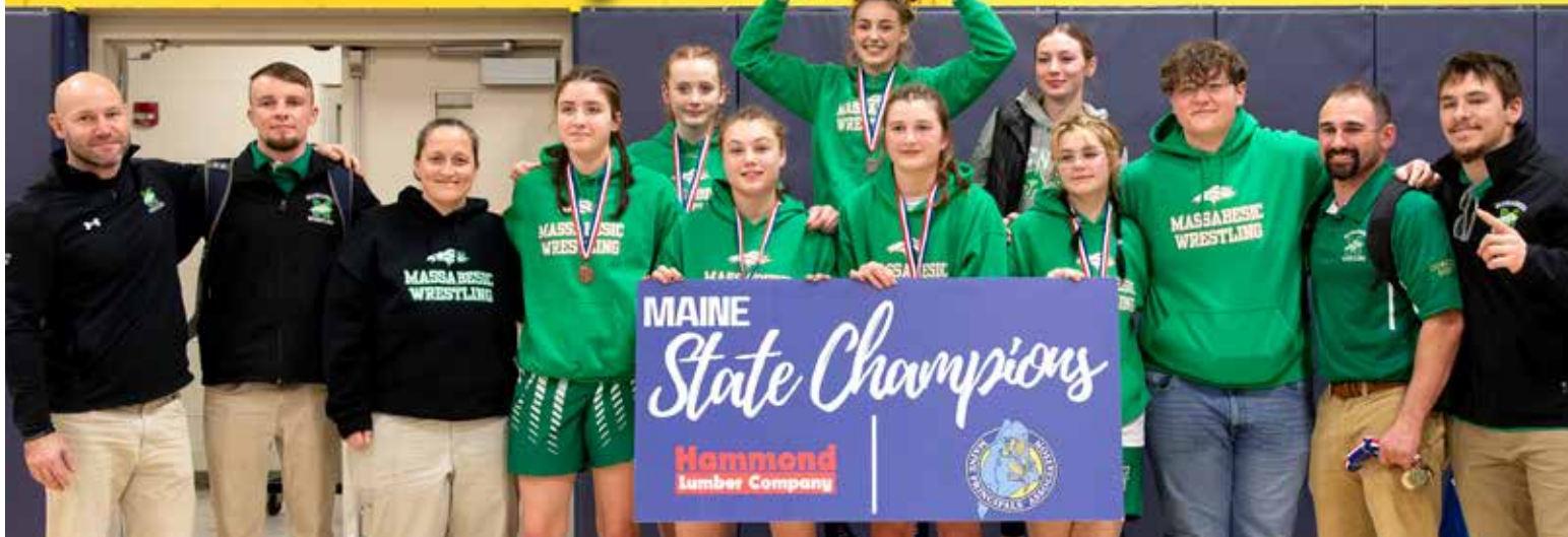
The Massabesic girls' wrestling team claimed the 2025 State Championship in Farmington on Feb. 18, and will compete at the New Englands on March 8 and 9 in Providence, Rhode Island.

FROM THE MAINE DEPT. OF AGRICULTURE, CONSERVATION & FORESTRY: