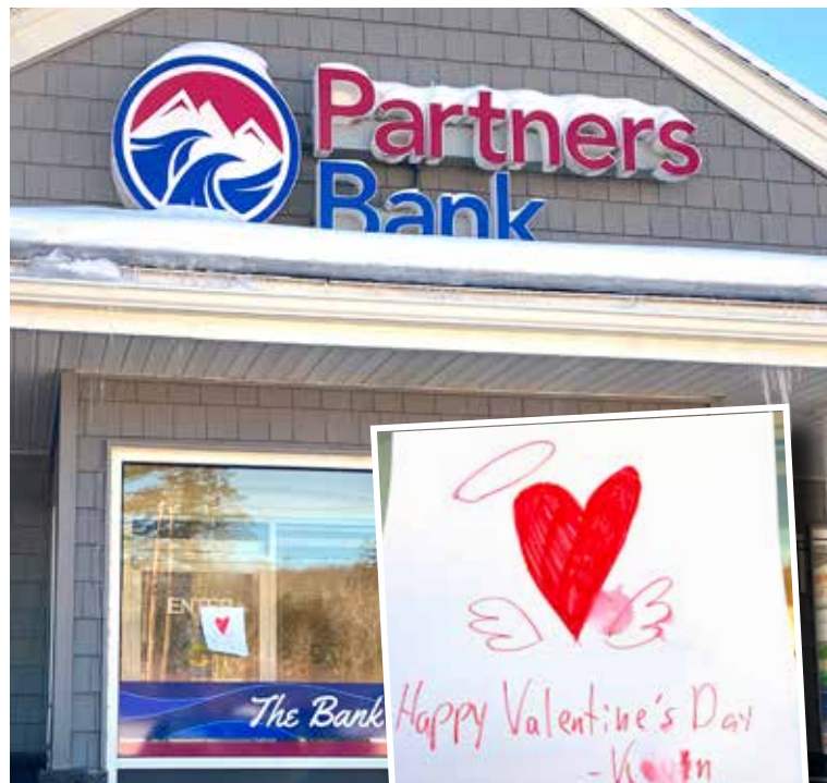
Mysterious valentines were hanging outside of Partners Bank and Associated Eye Care on Feb. 14, presumably inspired by Portland's Valentine's Bandit.